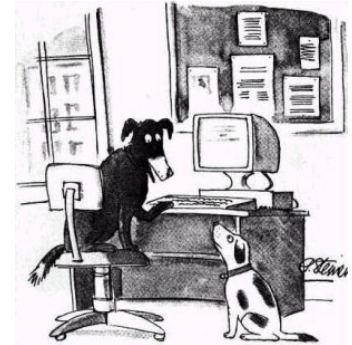
"On the Internet, nobody knows you're a dog."

"Oh Great-Grandma, my friends and I learn so much by talking to you. I love you!"